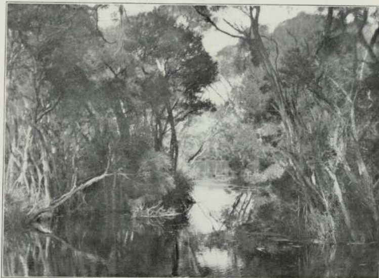
Here, in this ti-tree swamp of over 30 acres, Mother Nature composes Corot-like vistas. To this retreat flock innumerable duck, snipe, and other game, and its waters harbour many rel.

country life. This interior view is the hall, looking towards the morning and drawing rooms. Trophies of the chase show the sporting proclivities of the owners. The fine heads include those of the yak from Ladak, Kashmir, black buck, and wild pig. In the foreground is an effective Kashmir carved palm stand of Chenarwood. The old print is a picture of a bygone uniform of the 15th Hussars. The walls are dark red, and choice Persian and Bokhara rugs enrich the colour scheme. Here and there are fine Benares brass urns.