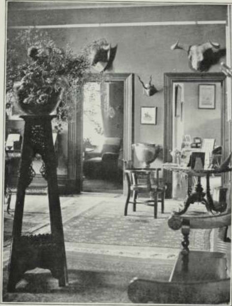
The "Coolart" homestead is one of those modern comfy houses, not over-decorated, but specially suited to the amenities of