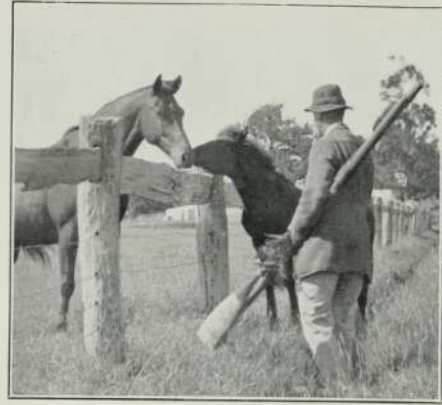
Major Balmain, at the boundary of the Bluff and home paddocks, perhaps listening to a little horse-sense between the pony foal and its elder relative.

country life. This interior view is the hall, looking towards the morning and drawing rooms. Trophies of the chase show the sporting proclivities of the owners. The fine heads include those of the yak from Ladak, Kashmir, black buck, and wild pig. In the foreground is an effective Kashmir carved palm stand of Chenarwood. The old print is a picture of a bygone uniform of the 15th Hussars. The walls are dark red, and choice Persian and Bokhara rugs enrich the colour scheme. Here and there are fine Benares brass urns.